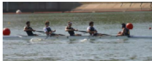
Varsity Men's Four

The Varsity Men were relentless in their training and their quest for more rowing knowledge. Due to the way the program was structured, time management, self discipline and self motivation were all put on the athlete's plate. Half the required training was to be done on their own. Not only did they complete the training, many of them did extra. I could not have asked more.