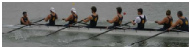
Varsity Men's Eight

Due to the generosity of our amazing group of parents we were able to purchase 3 new sets of oars and a new eight last spring. This was the first equipment purchase for the men since the 99-2000 season. An initial gift, matched by Countrywide got the ball rolling and most of the parents quickly pitched in to finalize the purchase. The adjustable length oars will help us accommodate the wide range in the size of our current athletes. The boat is made by Filippi and the hull, the F9, is a copy of the design the former East German company "VEB" made popular in the late 70's. I do not know of any college programs rowing this hull as it is very hard to row but it is used at the international level, most recently by the German Women in Lucerne where they won Gold.