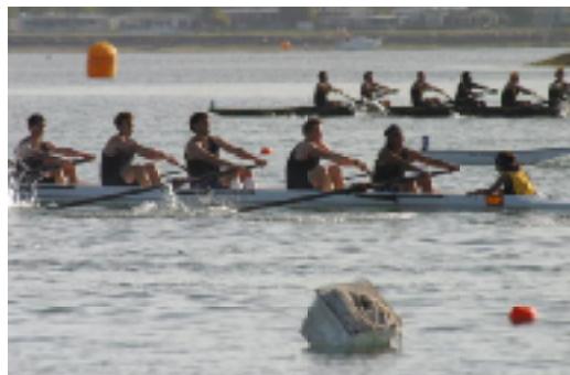
Novice Men's Eight San Diego Crew Classic