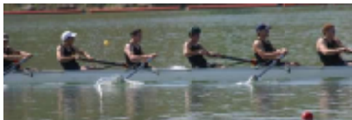
Novice Men's Eight

For the Novice Men it was evident early on that they were racers. They practiced everyday as if they were rowing in a race. With almost 20 athletes the entire season, competition for seats was fierce and the line-up's changed throughout the season. Both eight's had some excitingly close racing throughout the season. Racing in the fastest novice heat at the WIRA Championship the Novice eight missed the grand finals, but showed what they were made of by winning the petite finals by 7 seconds.