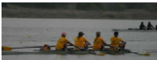
Novice Women's Four

The Novice Women not only worked hard they also began to understand the stroke. Technically this group was a bit more advanced than the average novice crew. Balance came early which allowed them to focus on more advanced skills. As the season progressed the crew added the ability to race to their list of advanced skills. This made for some exciting and close races. The season ended with half the eight doubling into the four at the W.I.R.A regatta which provided one more opportunity to gain race experience. More race experience proved crucial in the seat racing that followed. Two of the novice women were able to seat race into the Varsity eight for the trip to Philadelphia to race in the Dad Vail regatta.