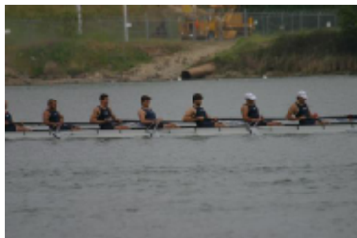
Varsity Men's Eight WIRA