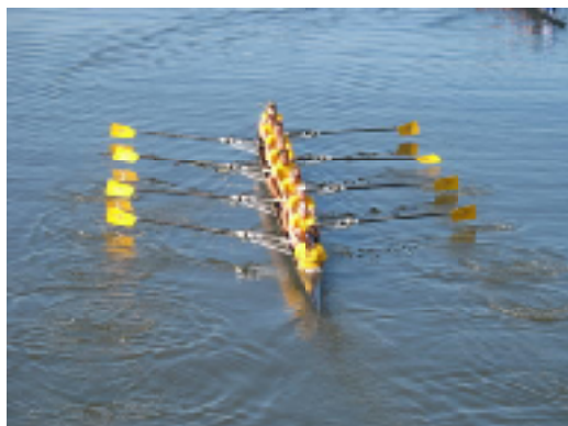
Novice Women's Eight UCLA 3/18/06